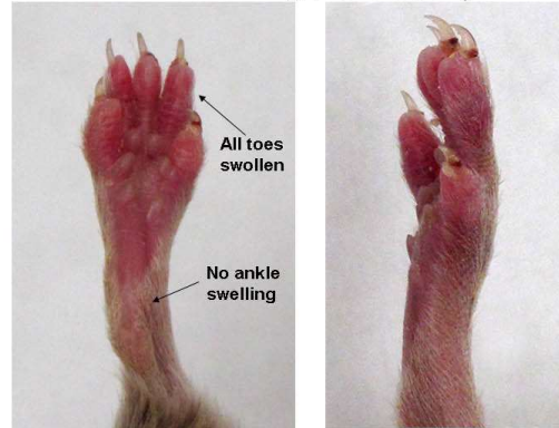
Score 2 (3+ toes inflamed w/no paw swelling, or mild swelling of entire paw)