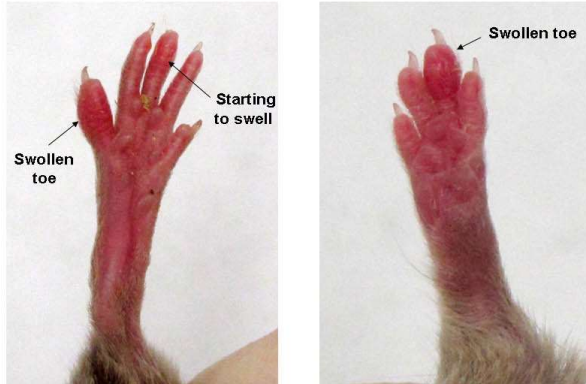
Score 1 (one or two toes inflamed and swollen)