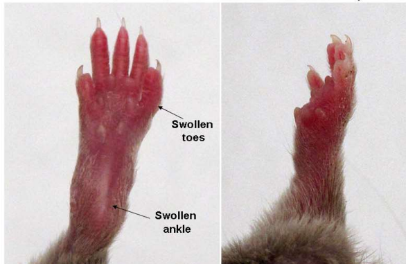
Score 3 (entire paw inflamed and swollen)